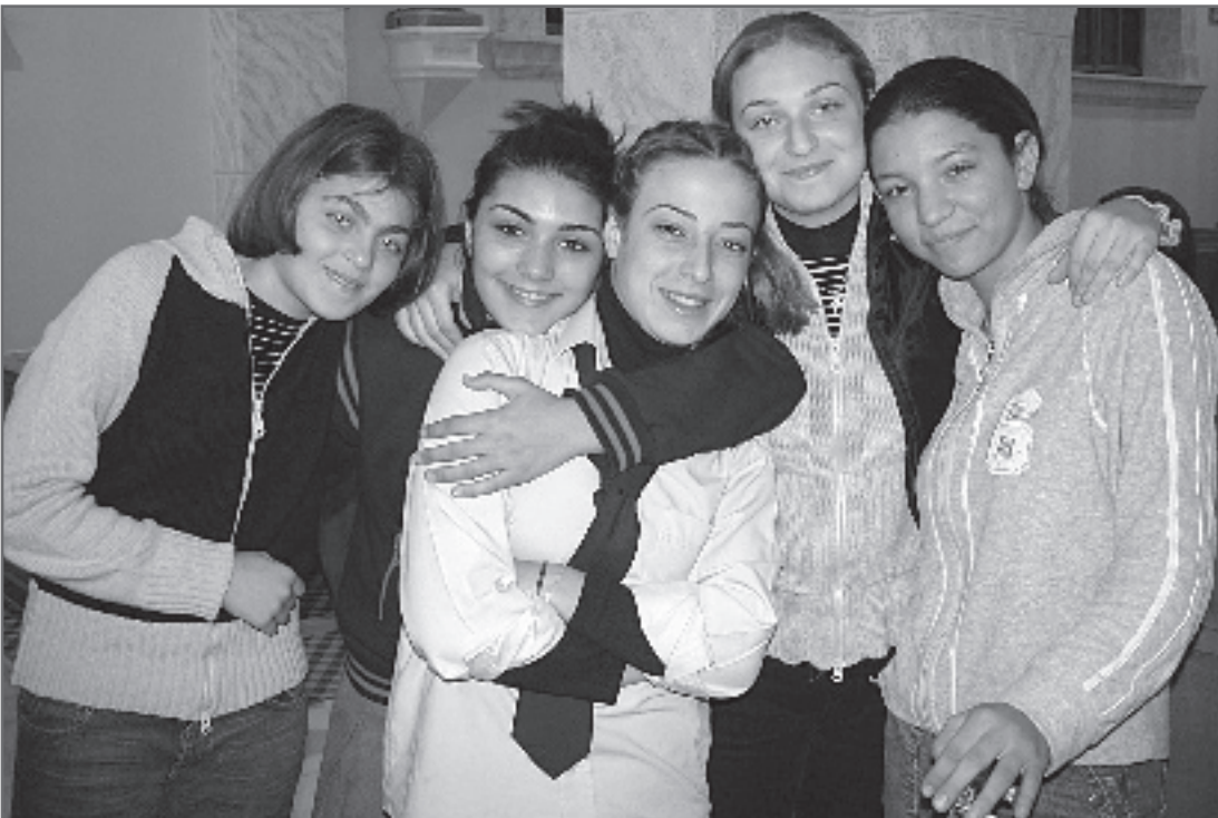
God really touched these teens at St. Anthony's in Mersin as they were prayed over for an outpouring of the Holy Spirit.

“ They have taken an almost desolate Catholic parish, whose nominal members attend only once or twice a year, and are evangelizing, baptizing, and catechizing Muslims into the faith. ”