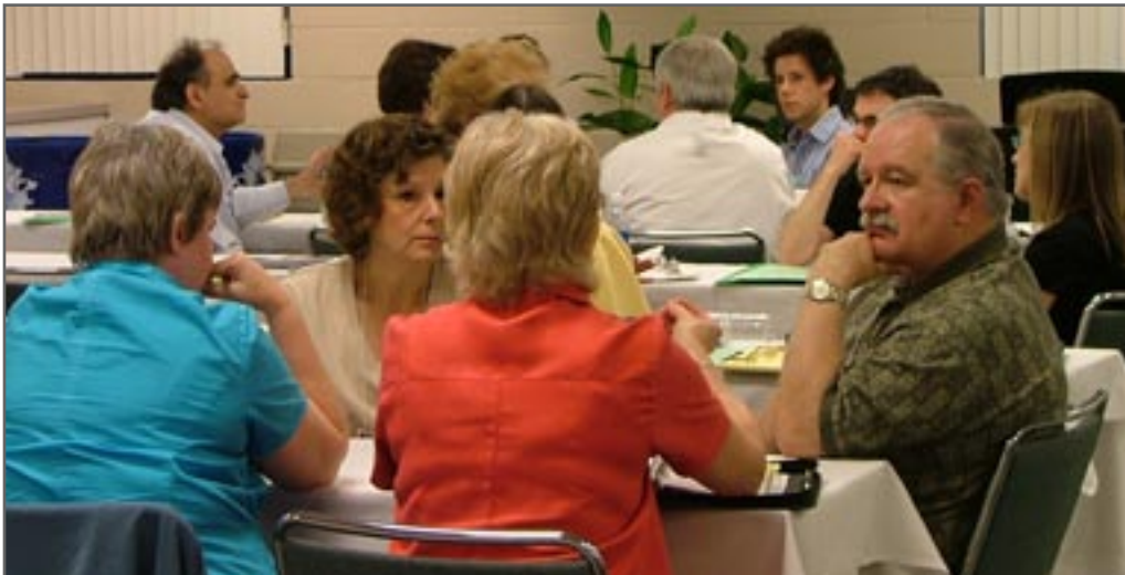
Students who attended the School of Spirituality were inspired, convicted, challenged, refreshed and awakened to a new passion for the call to holiness.

“The School of Spirituality was water on the oasis. It has watered my soul and heart.”