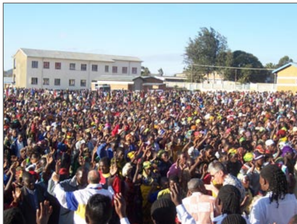
Many villagers often accompanied by small children and babes on the back, walked from 25–30 miles away to attend the outdoor rallies in Iringa, Tanzania.

“ The Iringa diocese is still a stronghold for animistic practices and the local witch doctors play a prominent role in the lives of many people. ”