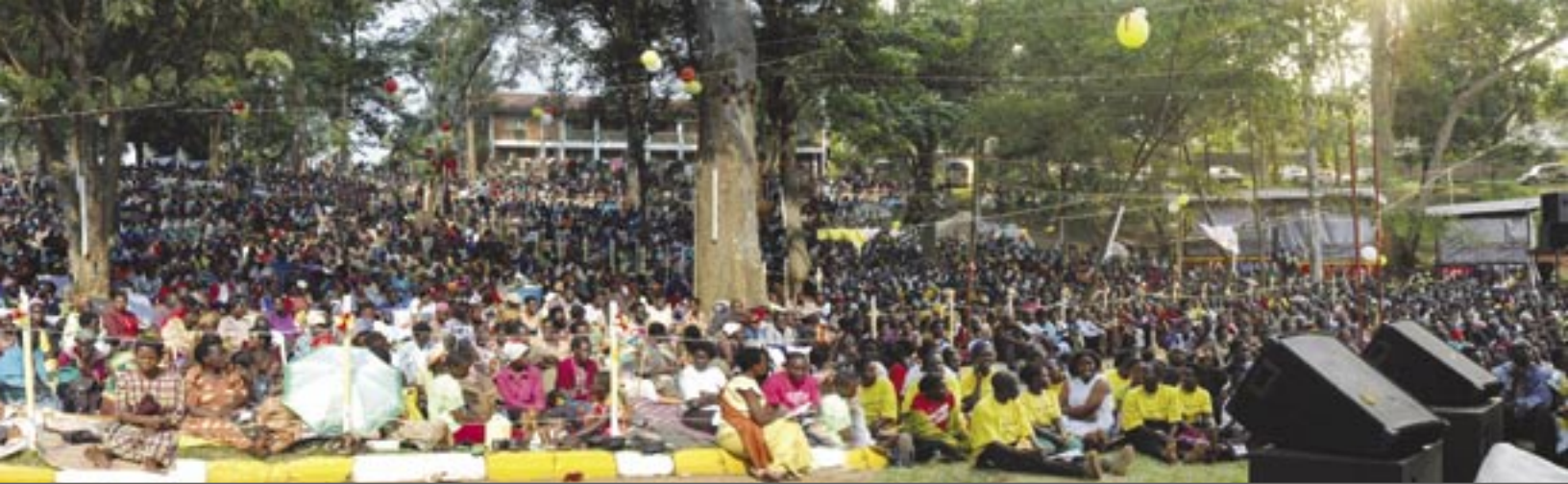
The National Conference in Namugongo, held before the priests retreat, drew more than 10,000 people from all over Uganda. Many people were on the road for several days and some walked over 200 miles to be at this powerful three day event.

an initial budget, but we soon discovered it wasn't enough. The brothers had received a word from the Lord, "to widen their tent pegs" and to make room for a big turnout and this was coming true. It was wonderful to see the response of the priests, but it also meant they needed to come up with more money.